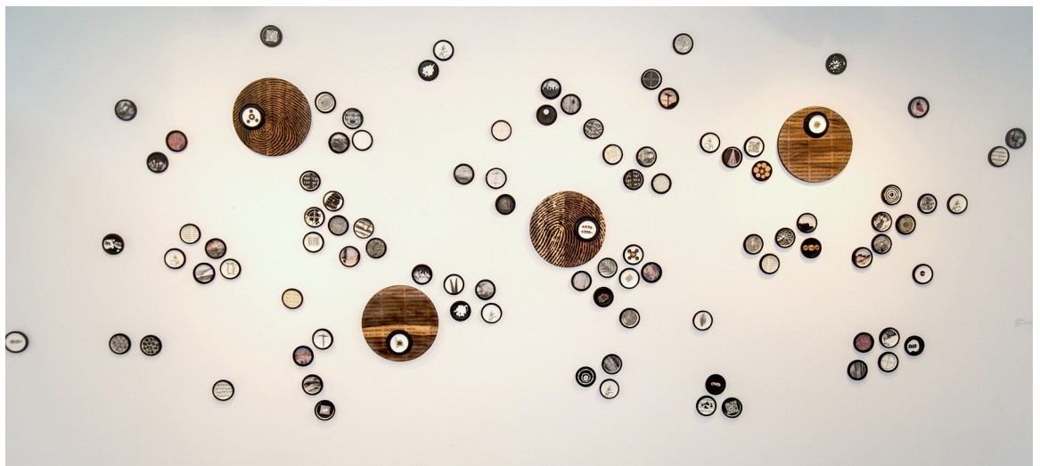
Tracy Spadafora, Collection , installation view.